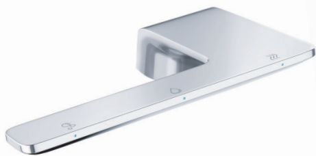
Next Gen Washbar