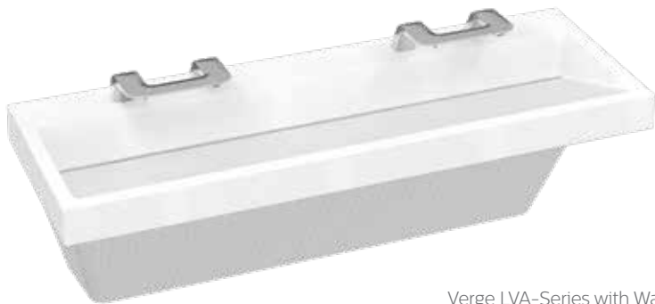
Verge LVA-Series with WashBar Duo

The new Duo is available with the Verge® LVA basin in Evero® natural quartz, OmniDeck™ 3010 in Terreon® solid surface, or as a stand alone unit.