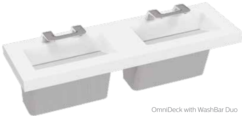
OmniDeck with WashBar Duo